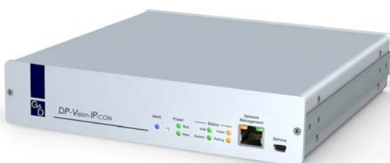
DP-Vision-IP extender system

Within the KVM-over-IP product family, the different extender variants are compatible with each other, allowing any mix-matching of different video interfaces on console and computer modules. However, data transmission with KVM-over-IP technology is not compatible with classic KVM extenders from G&D.