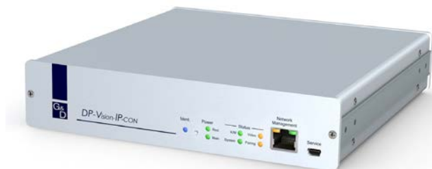
DP-Vision-IP-CAT-CON - front view