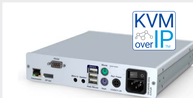
DP-Vision-IP - rear view

By means of manual bandwidth management, the transmission can be adapted to a wide range of bandwidth requirements. Video, keyboard, mouse and control data is encrypted with AES-128.