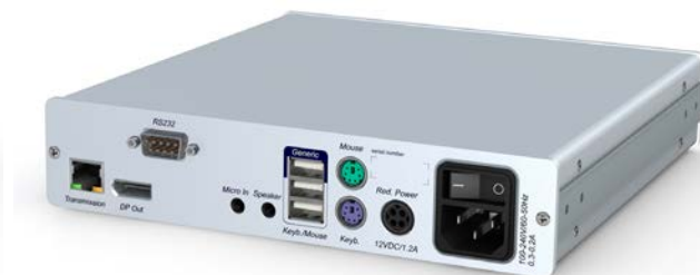
DP-Vision-IP-CAT-CON - rear view