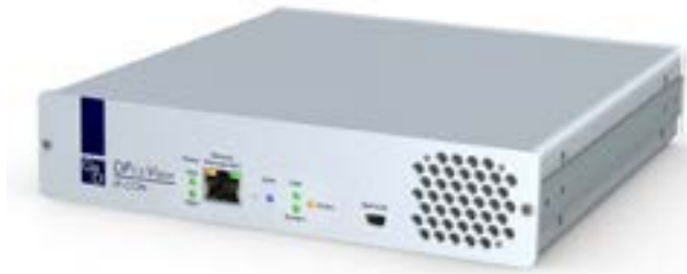
DP1.2-Vision-IP-CAT-CON - front view