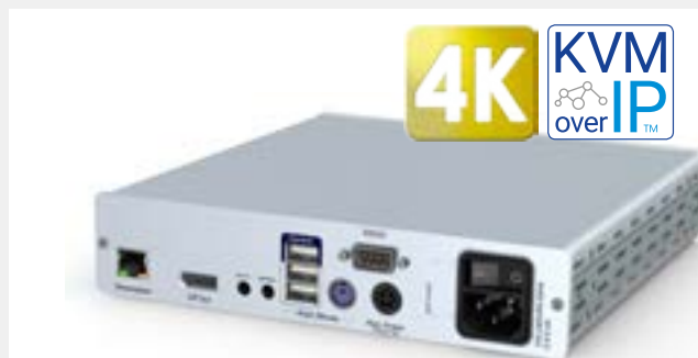
DP1.2-Vision-IP - rear view

By means of manual bandwidth management, the transmission can be adapted to a wide range of bandwidth requirements. Video, keyboard, mouse and control data is encrypted with AES-128.