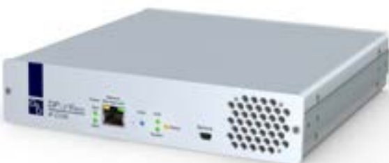
DP1.2-Vision-IP extender system

Within the KVM-over-IP product family, the different extender variants are compatible with each other, allowing any mix-matching of different video interfaces on console and computer modules. However, data transmission with KVM-over-IP technology is not compatible with classic KVM extenders from G&D.