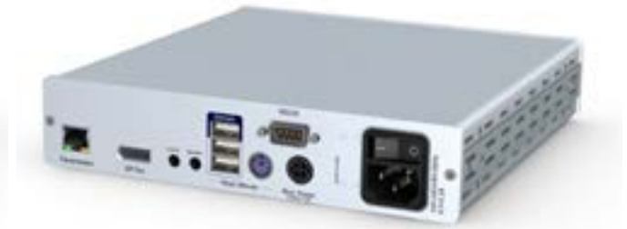
DP1.2-Vision-IP-CAT-CON - rear view